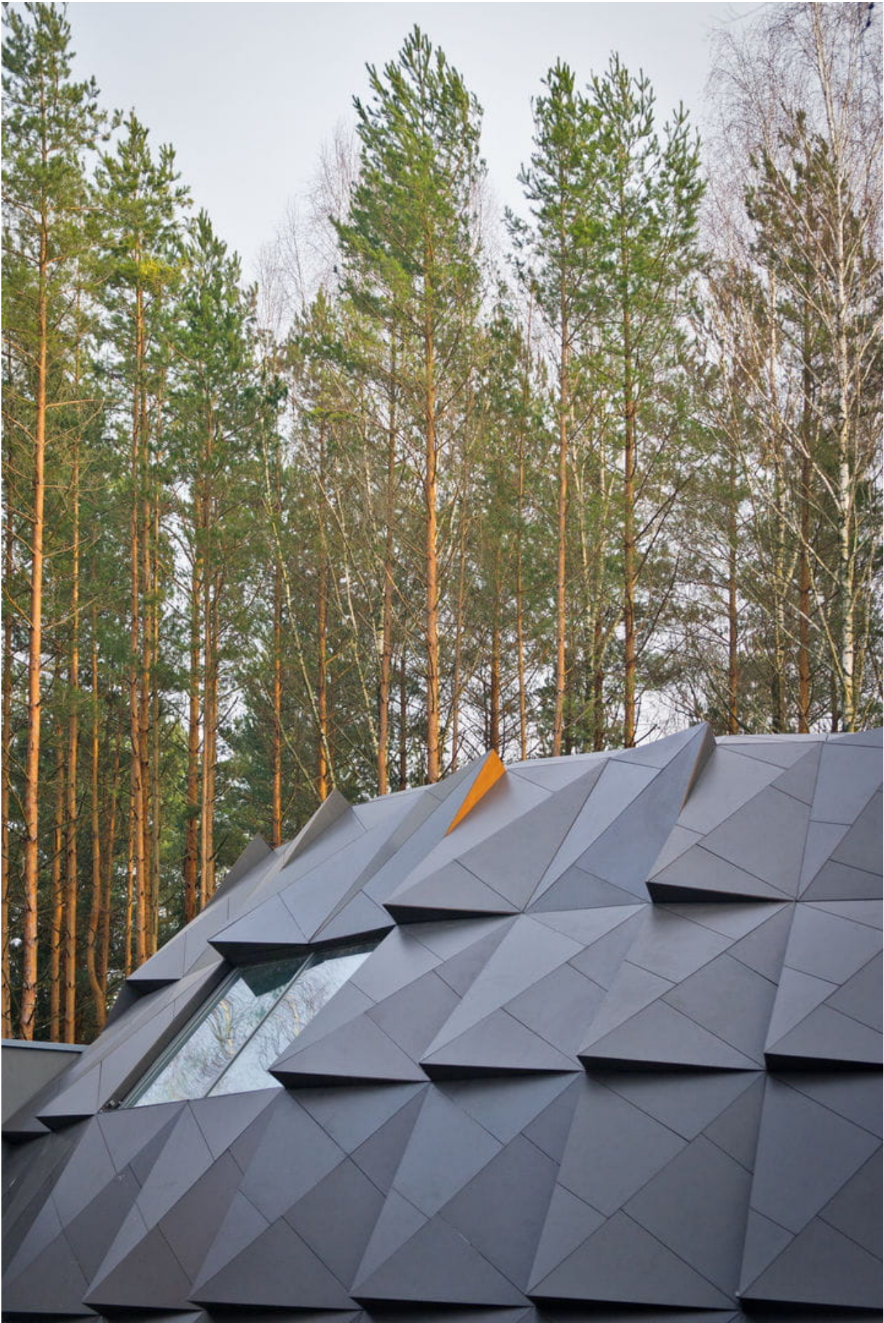
SPA Vilnius Anykščiai wellness and relaxation center